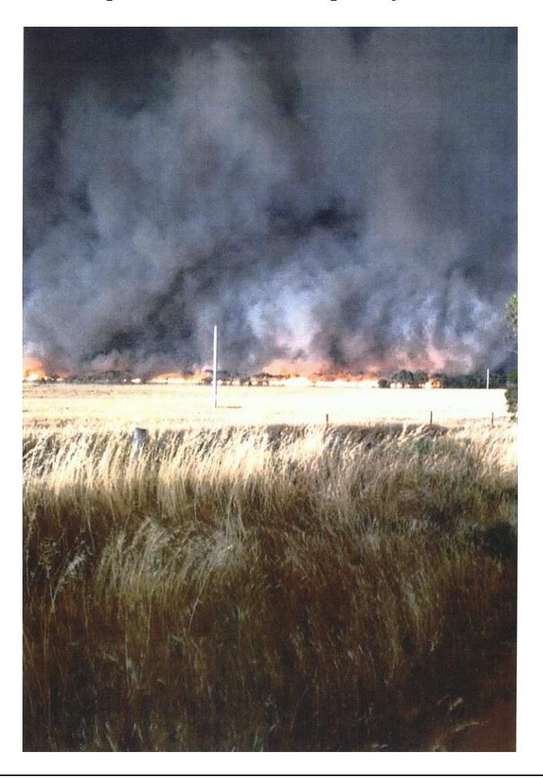
The above photograph depicts a portion of the intensity of the fire

377. It is a trite saying that a picture paints a thousand words, but the picture below does show visually the sheer scale of what the firefighters in Esperance faced in November 2015 when the Cascades fire raged out of control. It must have been terrifying to behold. Experienced firefighters said that they had never before seen anything like it, in terms of its speed and ferocity. It was an unprecedented, and hopefully rare, event.