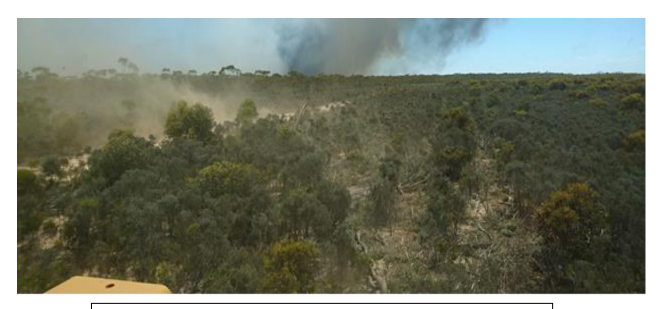
The above photo depicts the fire in the background as bulldozers clear fire breaks