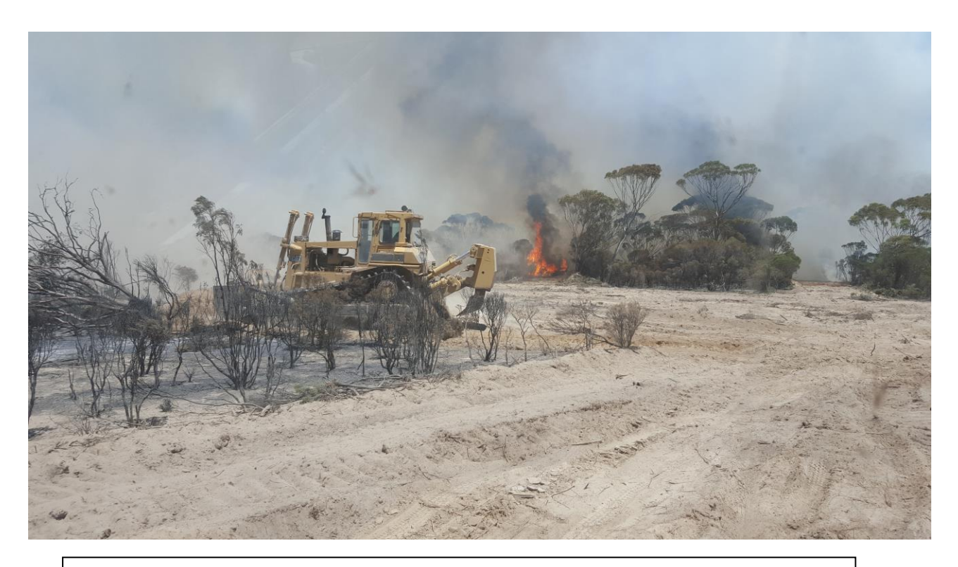
The above photo depicts the grader clearing the bush with the fire in the background as explained in Mr Carmody's evidence