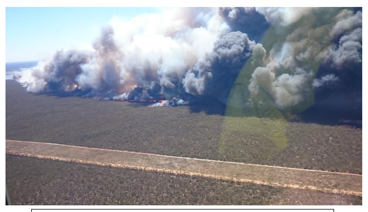
The above aerial photograph depicts the front of the fire having broken the containment lines