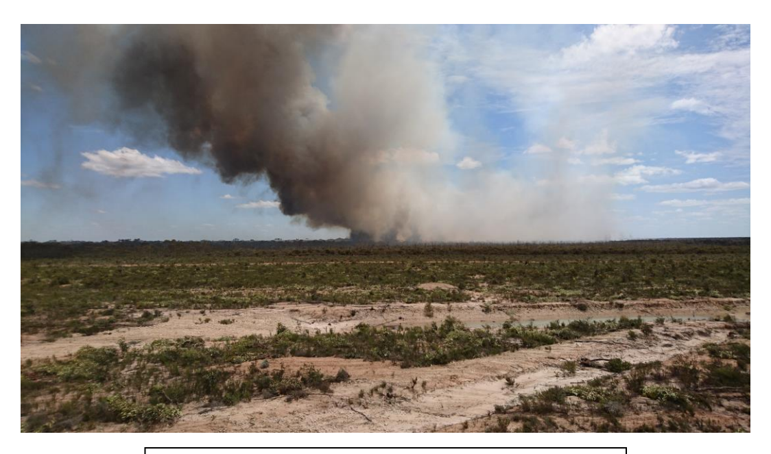
This photo shows the fire in the distance on Monday, 16 November 2015